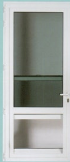
Ventilating Panel Allows Maximum Air Flow To Help Reduce Energy Costs

Our unique operable vent allows the cool tropical breeze to flow throughout your home. No other entry door system offers the volume of air flow throughout your home as ETI's Tradewinds Entry Doors, with up to 50 square feet of air flow from our 24" operable self-storing sash. And our modern vent design allows the ultimate protection in home security for the safety of your family and your personal possessions.